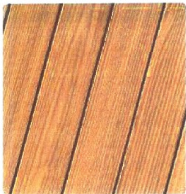
Cedar Naturaltone Semi-Transparent